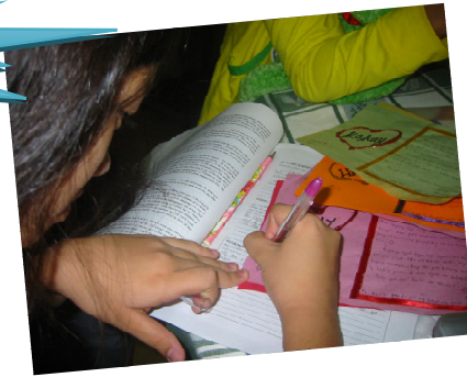
Youth shows creativity by making posters to summarize what they've learned. Here's one!