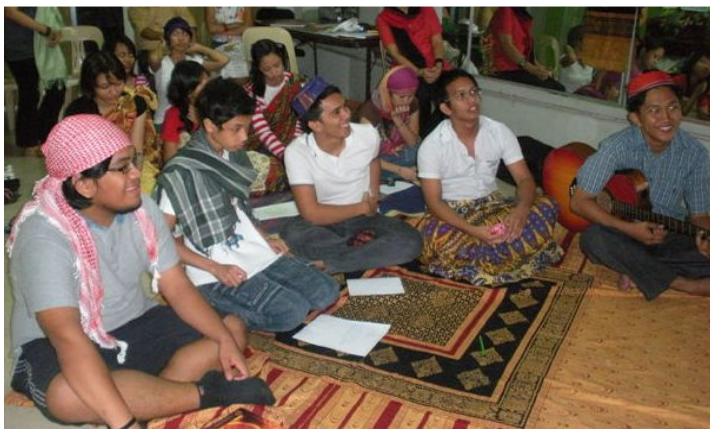
Our team learns the art of contextualized worship: Worship in consideration of one's cultural background