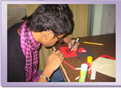
What's with the purple scarf?