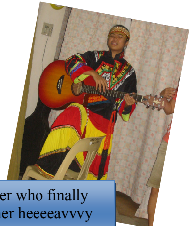
A Nosu worship leader who finally gave up on wearing her heeeavvy headdress ☺