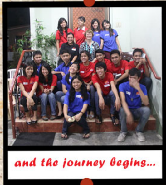
and the journey begins...