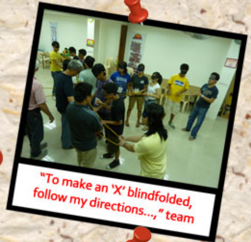
"To make an 'X' blindfolded, follow my directions...," team