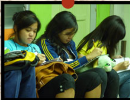
notes notes notes!!