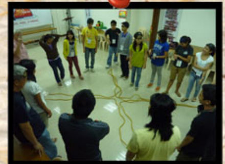
Viola! "X" marks the spot :)