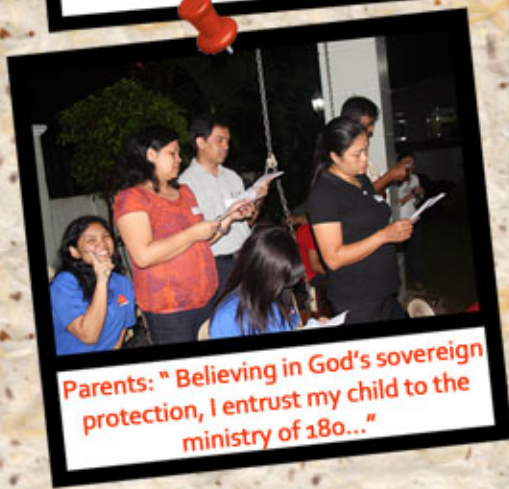
Parents: "Believing in God's sovereign protection, I entrust my child to the ministry of 180..."