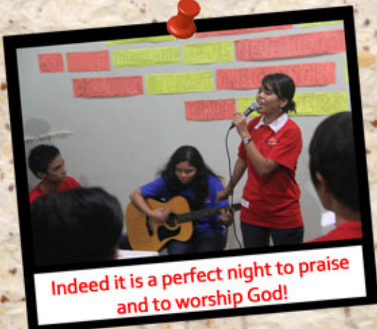
Indeed it is a perfect night to praise and to worship God!