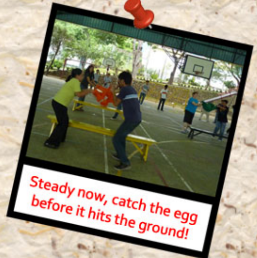
Steady now, catch the egg before it hits the ground!