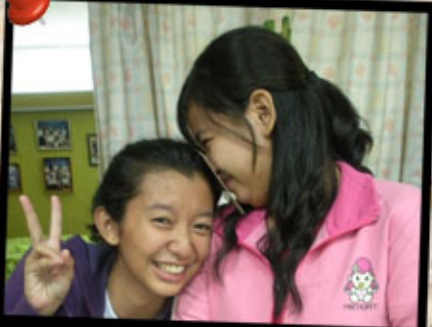
"Funny Bones" literally bonds the members together... :)