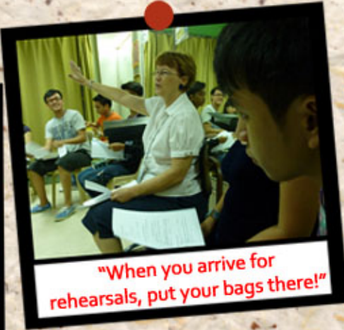
"When you arrive for rehearsals, put your bags there!"