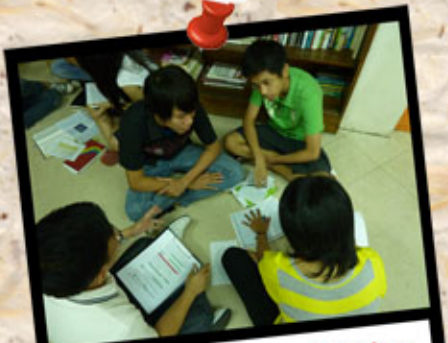
Fund-raising 101: Writing Fund-raising Spiels