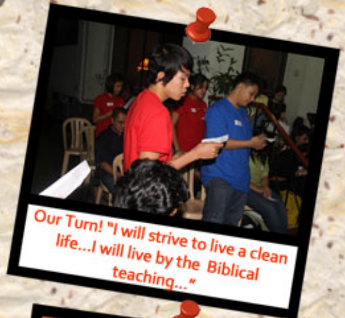
Our Turn! "I will strive to live a clean life...I will live by the Biblical teaching..."