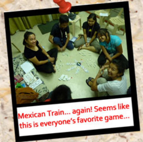
Mexican Train... again! Seems like this is everyone's favorite game...