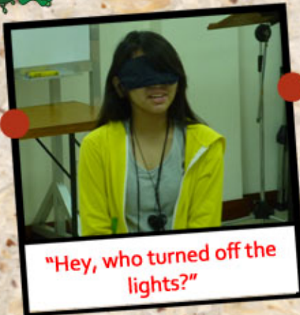
"Hey, who turned off the lights?"