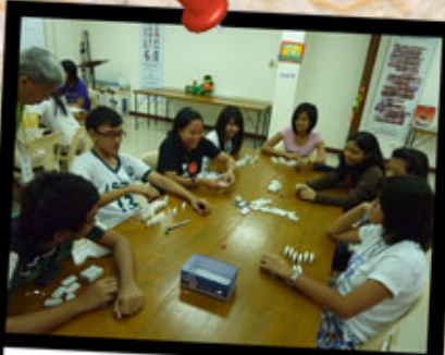
Building the "Mexica Train" Choo! Choo!