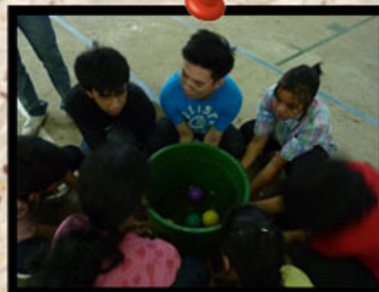
"Everyone ready? On your mark... get set.. Heave Ho!!!"